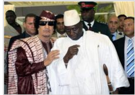
With formidable opposition challenge in 2011, Yahya Jammeh must go